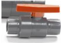
CHEMKOR - COMPACT BALL VALVES, MIP VALVES BALL CHECK & BUTTERFLY VALVES